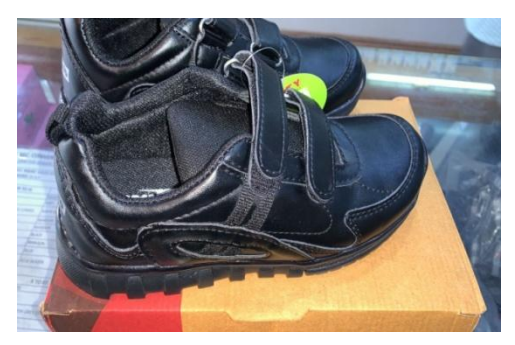
Black Velcro shoes