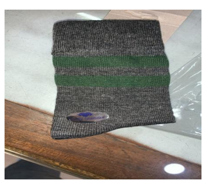
Grey Woolen socks with green stripes